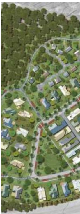
Angels Beach North