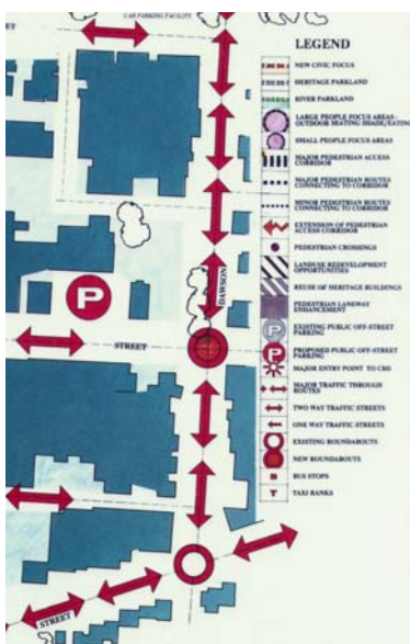
Site Analysis Plan for Lismore CBC