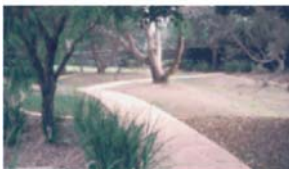
Constructed works at Tallow Beach Estate